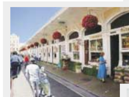
Barnstaple's famous "Butchers Row"

At Barnstaple, there is train station that will take you to Exeter and beyond or you may prefer cycling on the unique Tarka Cycle Trail that covers over 30 miles.