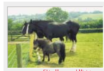
Shire Horses and Miniatures